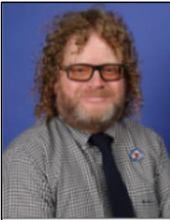
Director of Learning