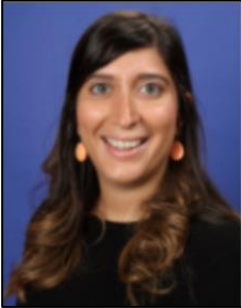
Director of Learning