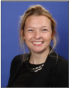
Assistant Principal - SENCo