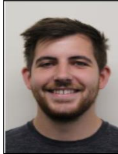
Director of Learning