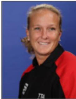
Director of Learning