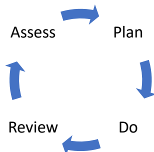
Figure 1: The Graduated Approach that underpins all of our SEND support processes at TTA: